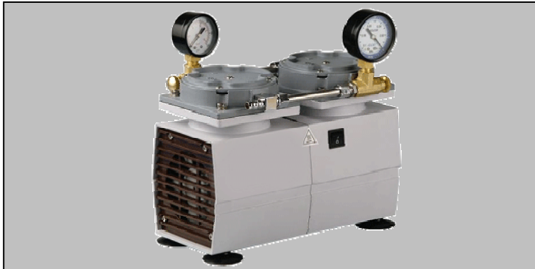
Pumpdown time for 20 ltr vessel