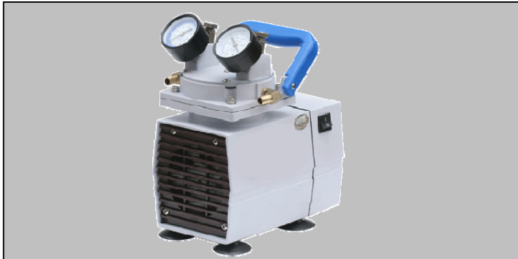
Pumpdown time for 10 ltr vessel