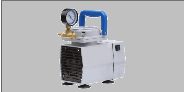
Pumpdown time for 10 ltr vessel