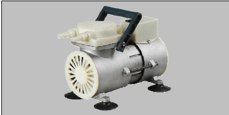
Pumpdown time for 5 ltr vessel