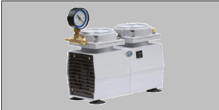
Pumpdown time for 10 ltr vessel