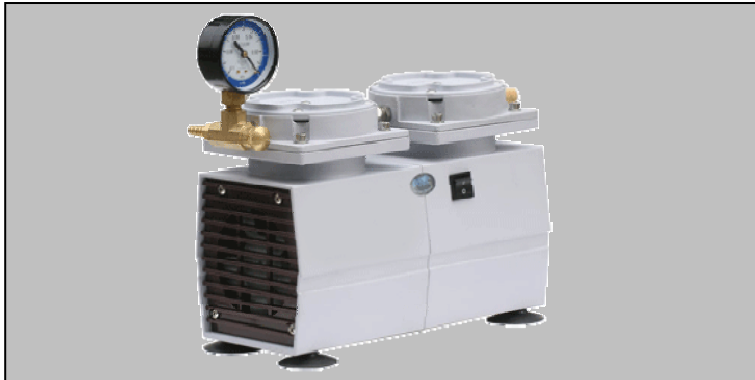
Pumpdown time for 20 ltr vessel